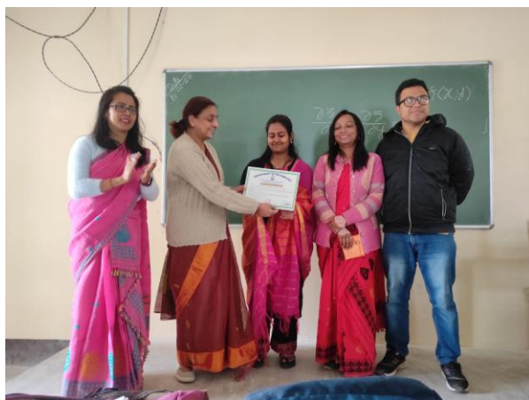
Topper of Department of Mathematics, 2022