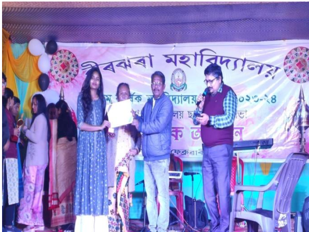
Topper of Department of Physics, 2023