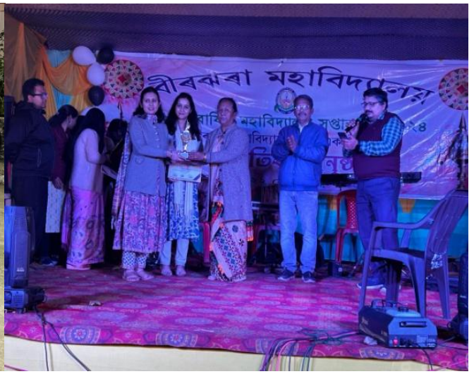
Topper of Department of Zoology, 2023