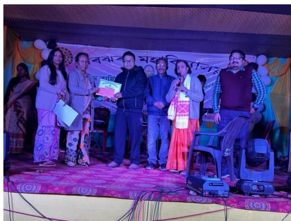
Topper of Department of Mathematics, 2023