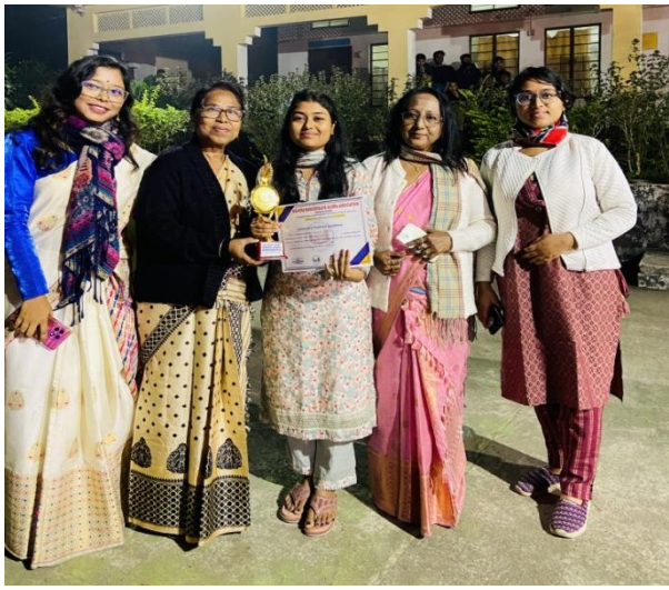
Topper of Department of Botany, 2023