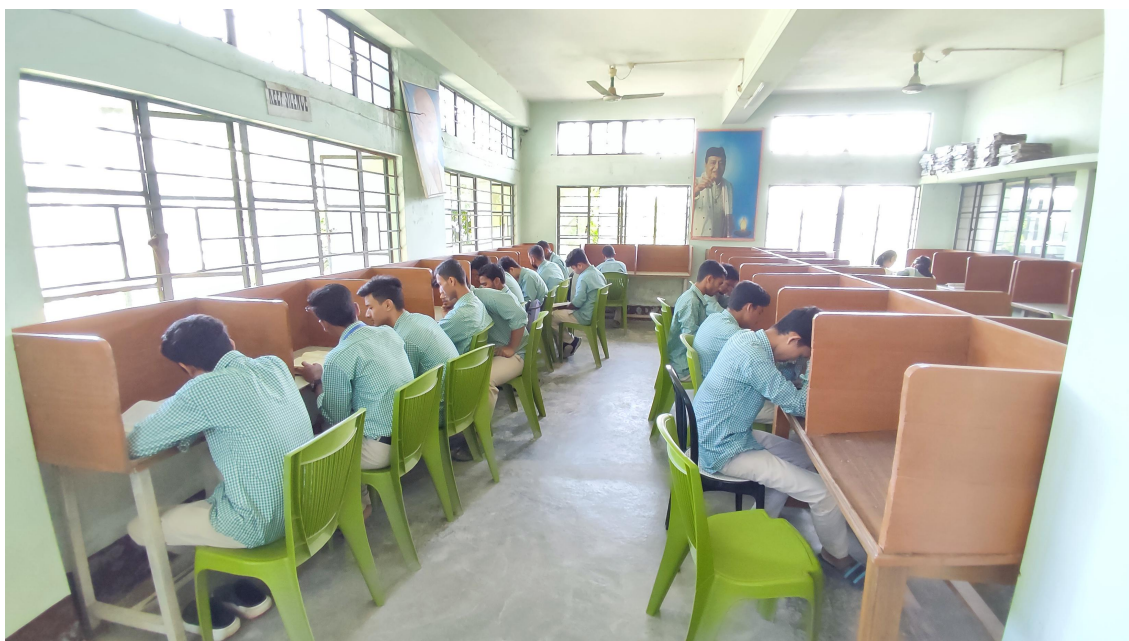
Students at Library